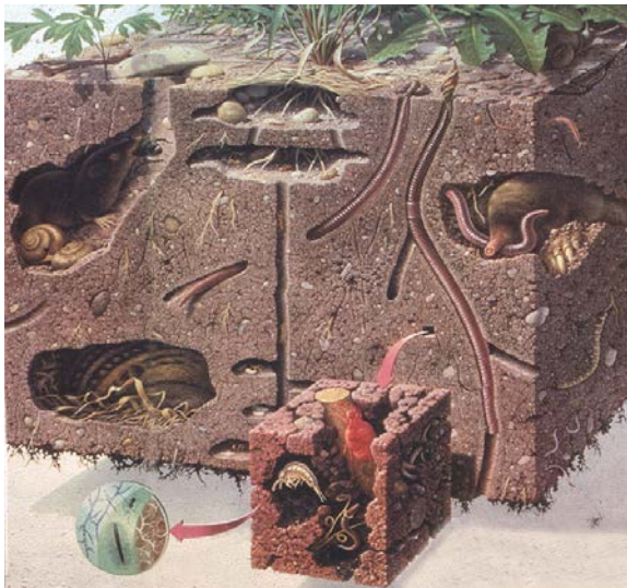
Diagram depicts formation of pores by different species.

Water storage, infiltration, and resistance to erosion. Soil biota form water-stable aggregates that store water and are more resistant to water erosion and wind erosion than individual soil particles. Threads of fungal hyphae bind soil particles together. Bacteria and algae excrete material that “glues” soil into aggregates. As they tunnel through the soil, the larger soil biota form channels and large pores between aggregates, increasing the water infiltration rate and reducing the runoff rate.